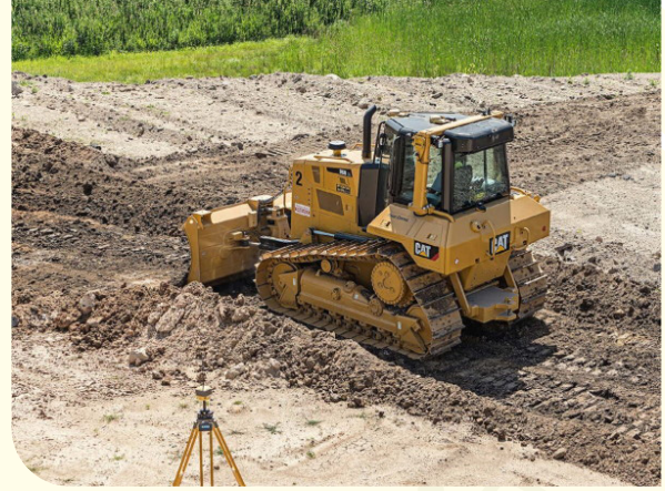
Plots levelled upto road