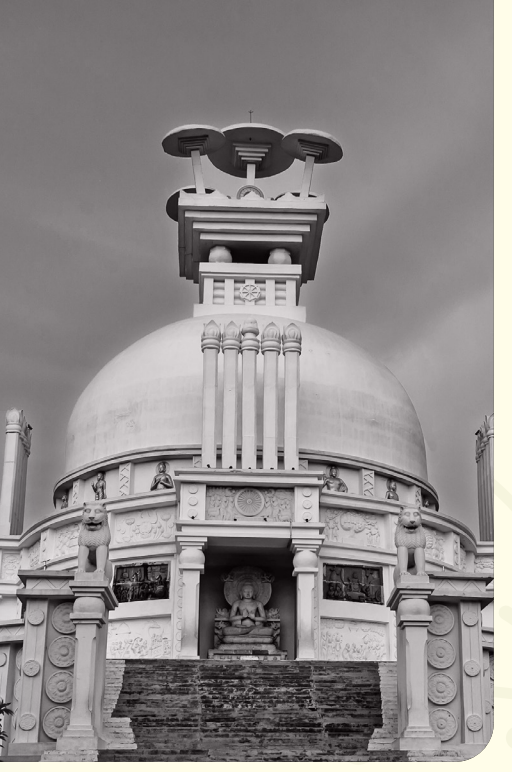
Neighbour to one of the world renowned tourist attraction; Dhauli.