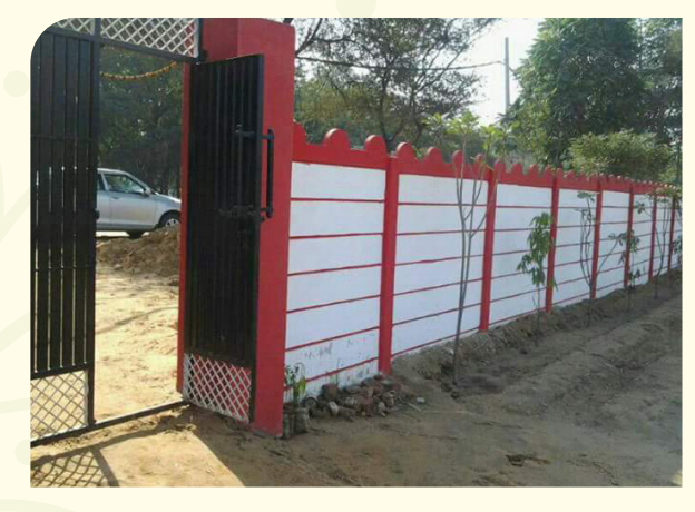
Individual boundary wall with gate