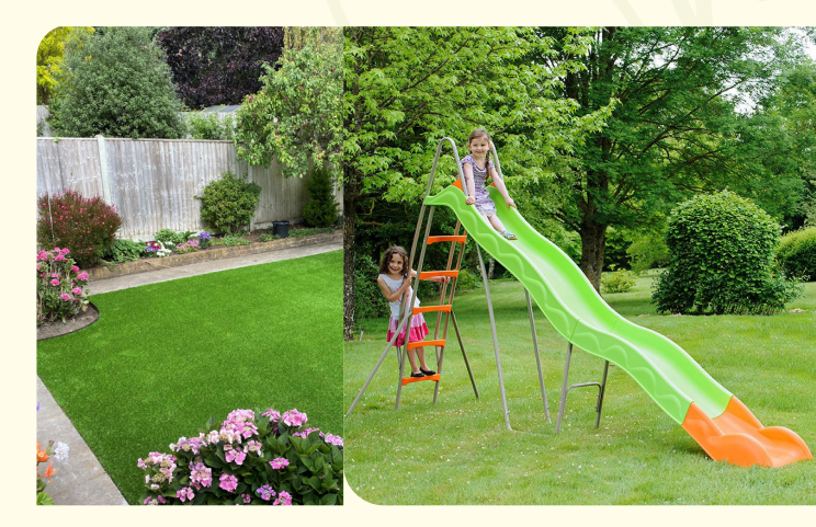
Children play area with Landscaped gardens

30 feet internal paved road with Drainage system