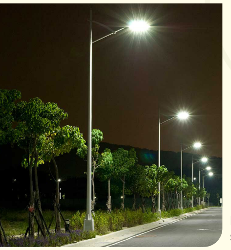
Electrification and street light